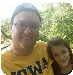
Princess Nation Father/Daughter Pairs 3-year old – 3rd Grade

The Arlington-Mansfield Area YMCA Nature Explorers Program provides fathers and their children the opportunity to spend valuable time together. Both Fathers and their children will have the opportunity to create unforgettable memories attending weekend camp-outs, participating in volunteer opportunities in the community, and attending special events like the Pinewood Derby and Daddy Daughter Date Night. This program focuses on the father/child relationship which helps strengthen families throughout the year.