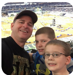
Guides Nation Father/Son Pairs 3-year old – 3rd Grade