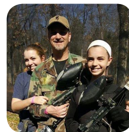
Trail Nation Father/Daughter or Father/Son Pairs 4th Grade – 16-year old